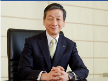
President and Chief Executive Officer, Otsuka Corporation